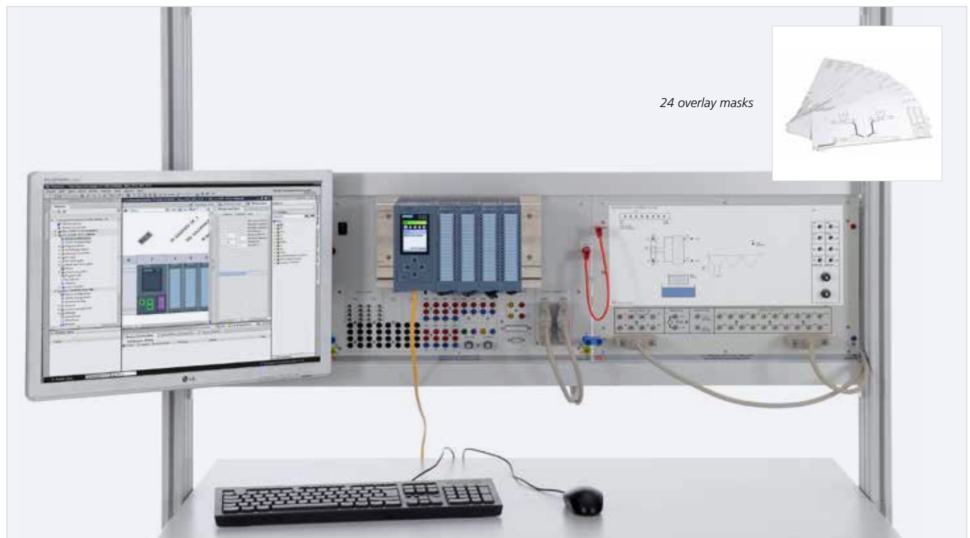
24 overlay masks

The PLC universal process system simulator has been designed especially for basic training in PLC technology. It is extremely well suited to graphic depiction and hands-on exploration of open-loop and closed-loop processes as found in industrial applications. By adding overlay masks, up to 24 different technical processes and models can be simulated. The projects are designed to precisely reflect official syllabuses.