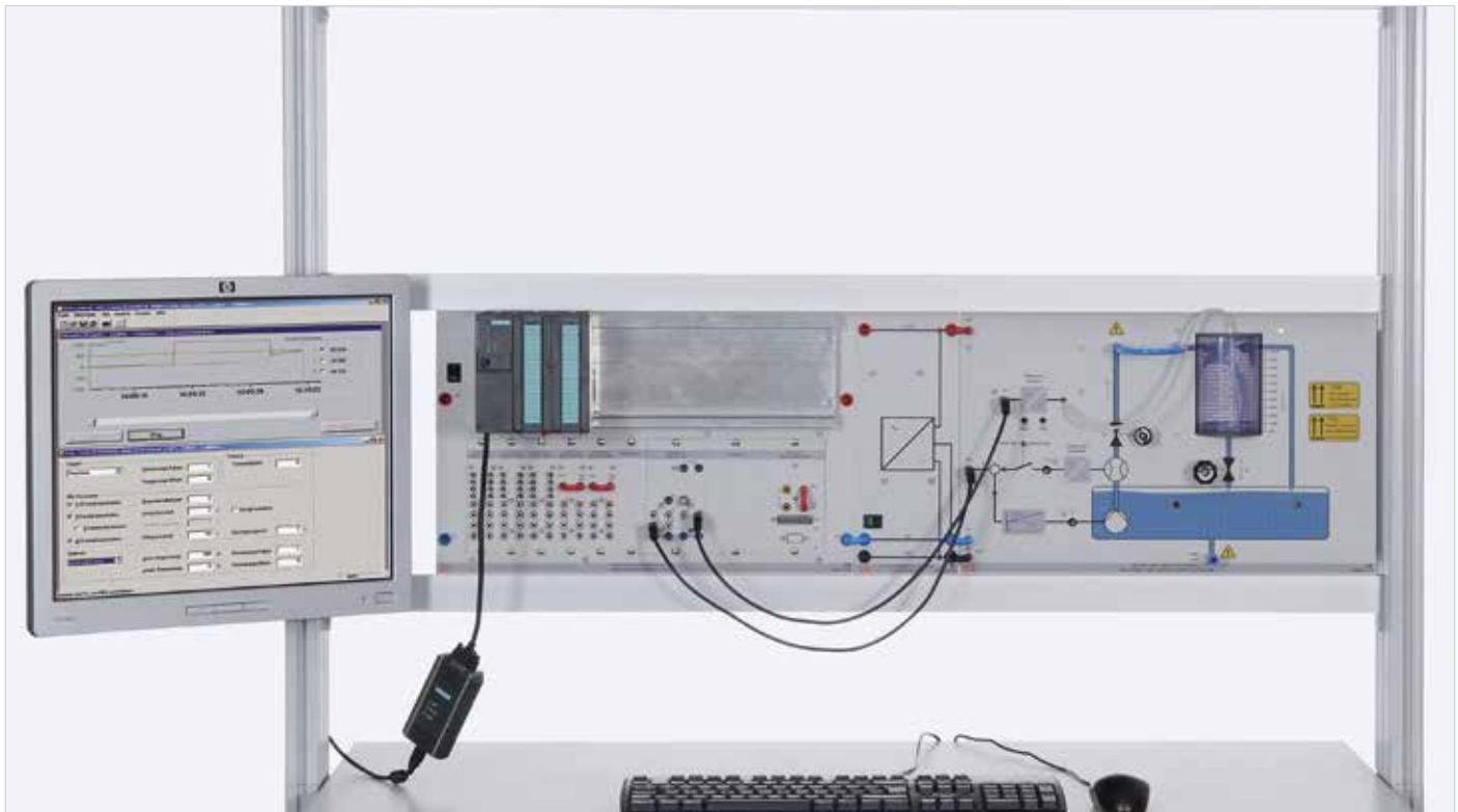
Experiment example "Liquid-level controlled system CLC 36"

Due to the fact that the controlled variable, that is to say the level of liquid, is immediately visible, this experiment is a particularly graphic one and thus eminently suitable for an introduction to automatic control technology. The compact training unit contains a liquid reservoir and a pressure transducer to determine the actual liquid level, as well as reserve tanks including a pump. Disturbance variables can be simulated using adjustable throttle valves which modify the inlet and outlet flows at the reservoir.