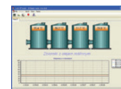
LUMEL - PROCESS SOFTWARE