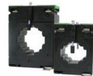
Current transducers LCT type.